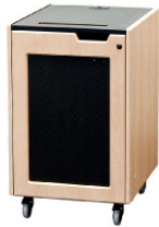
Code REX16-P (Perforated Metal Door)