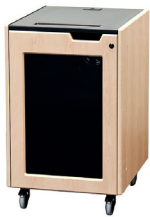
Code REX16 (Acrylic Door)